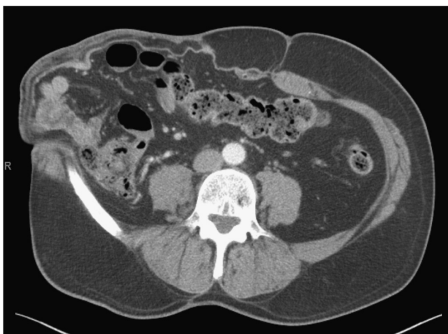
Fig. 3. CT-scan of bulging mesh four years after reconstruction (2012).