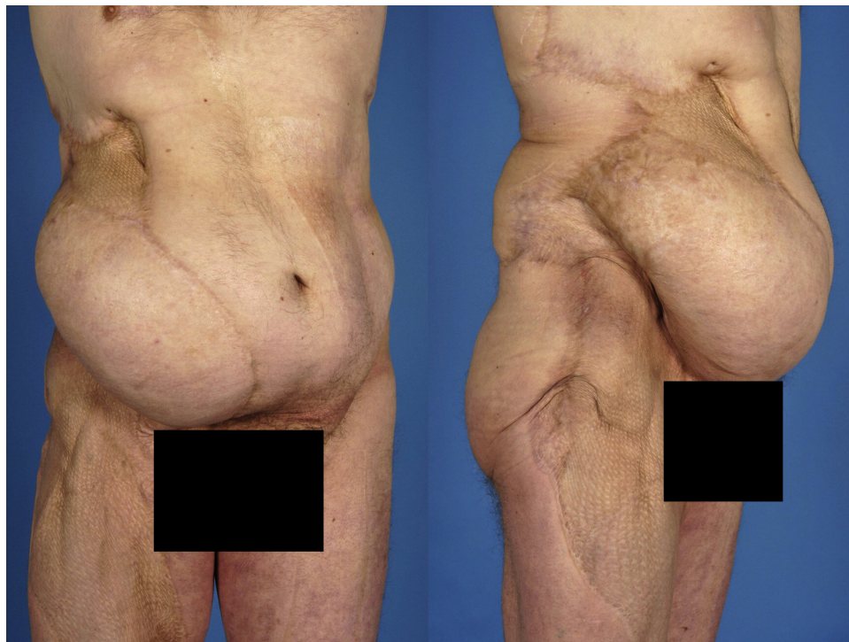
Fig. 2. Increased bulging of the abdominal wall four years after reconstruction (2012).

The soft tissue defect was repaired at the sides of the hernia with skin obtained by using multiple tissue expanders. The soft tissue defect was covered with a free vascularized latissimus dorsi flap with large full thickness skin graft (Fig. 1). Four years after the final repair the patient returned to the outpatient department with progressive swelling of the right lower abdomen (Fig. 2). He suffered from abdominal pain and protrusion that interfered with his work.