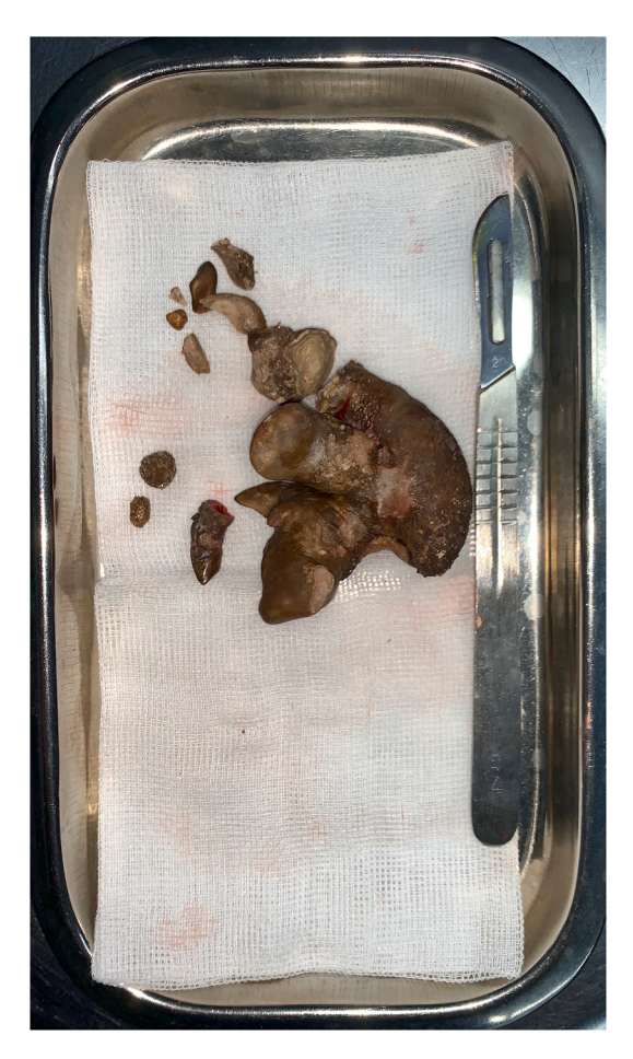
Fig. 4. The right stones were removed.

Laparoscopic/robotic surgery could be offered in rare cases of anatomic abnormalities, with large or complex stones, or those requiring concomitant reconstruction [1,2,6]. Giedelman C et al. (2012) performed eight laparoscopic anatrophic nephrolithotomies in adult patients with renal staghorn stones [11]. All procedures were completed laparoscopically with 20.8 min of the mean warm ischemia. The stonefree rate was 62.5% (5 patients) during follow-up imaging at 15 days. For Giedelman's report, we consider the term 'modified anatrophic laparoscopic nephrolithotomy' is more exactly because the surgical