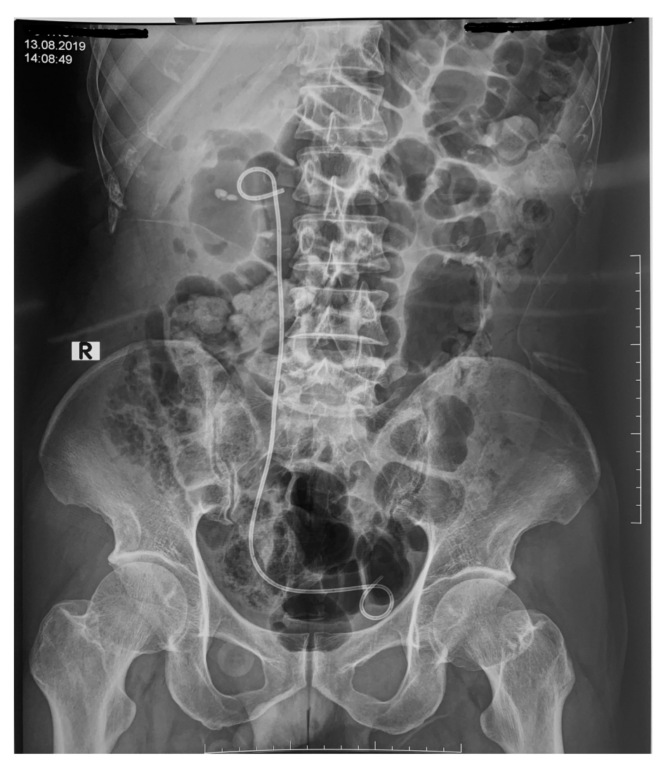
Fig. 5. Postoperative KUB radiograph, after right stone removal.