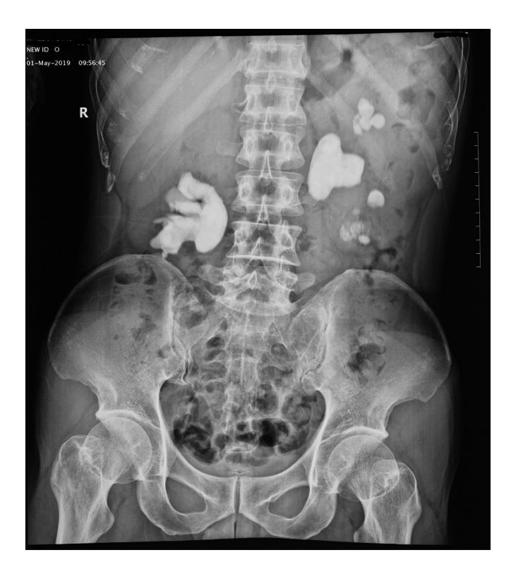
Fig. 1. KUB radiograph, before surgery.

A skin incision was made at the level of the 12th ribs from the midaxillary line and extended medially to the lateral border of the rectus abdominis muscle. The renal pelvis and proximal ureter were carefully dissected and thoroughly mobilized, preserving the periureteral tissues. An incision was made in the lateral edge of the renal pelvis, the large