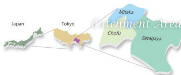
Figure 1. Catchment area of TTC.

TTC is a multidisciplinary longitudinal cohort study. The study is conducted at three municipalities in metropolitan area of Tokyo, Japan. The sample was recruited from the participants in the Tokyo Early Adolescence Survey (T-EAS), 12 which was a cross-sectional survey on psychological and physical development of general adolescents 10 years old, and data from T-EAS were treated as the first wave of data for the TTC. Participants of T-EAS were recruited between October 2012 and January 2015. A broad range of adolescents from a wide geographical area, extending 9598 m 2 in three municipalities (Setagaya-ku, Mitaka-shi, Chofu-shi) in the metropolitan area of Tokyo, were recruited into T-EAS (Figure 1). Children who lived in the municipalities and were born between September 2002 and August 2004 were recruited from the area using the resident register in each municipality. Among 18 830 eligible children, 14 553 children were randomly chosen due to a limited research budget (Figure 2). An invitation