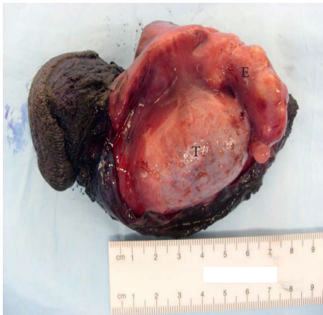
FIGURE 2: Opened scrotal sac with the exposed testicle (T) and enlarged and nodular epididymis (E).