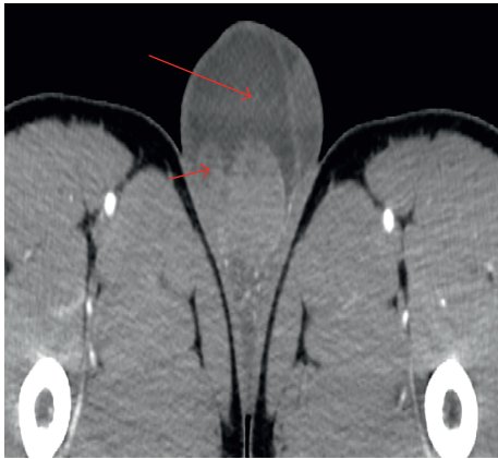
FIGURE 1: Axial computed tomography (CT) image, depicting a heterogeneous right testicle, with associated right scrotal fluid collection (long arrow) and inflamed right epididymis (short arrow).