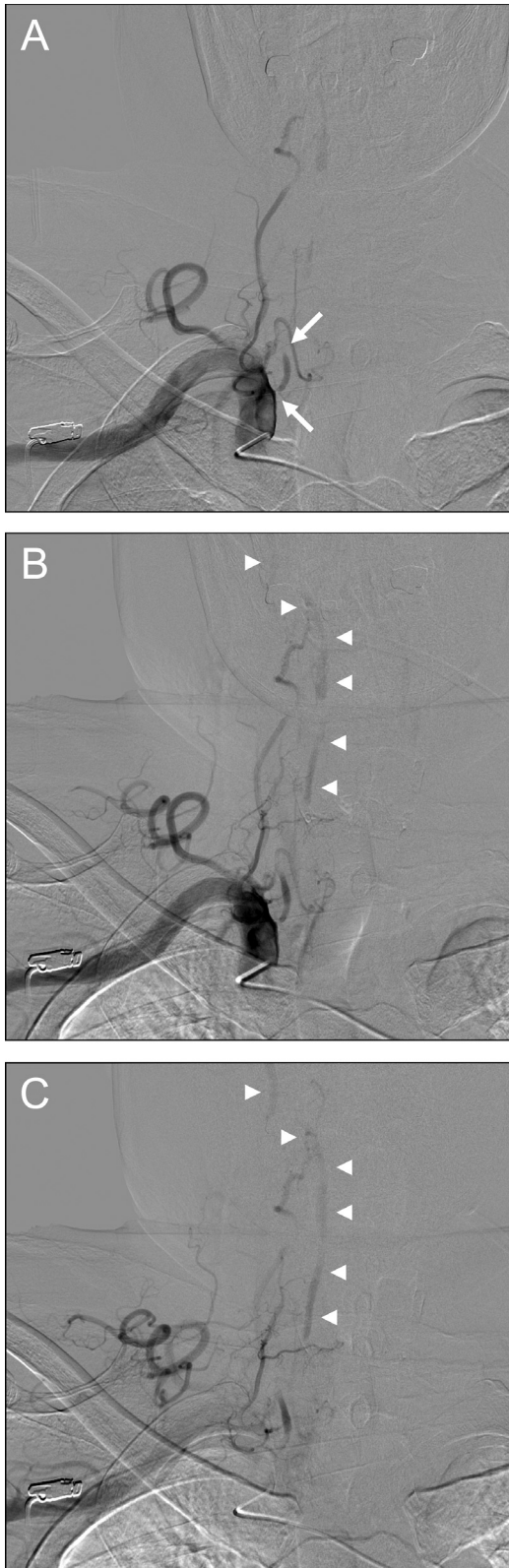
Fig. 2 – Digital subtraction angiography revealing severe stenosis (functional obstruction) at the origin of the right vertebral artery with stagnant blood flow (arrows) (A). Distal antegrade flow of the right vertebral artery (arrow heads) was supplied via collateral pathways from the deep cervical artery (B, C).

with unfavorable outcomes in 25% [2]. There have also been reports of fatal cases such as basilar artery occlusion associated with VASS [3]. Our patient experienced recurrence just 1 month after the initial event and required re-treatment. Although we considered endovascular intervention in the case of any further ischemic events, this has fortunately not yet been necessary.