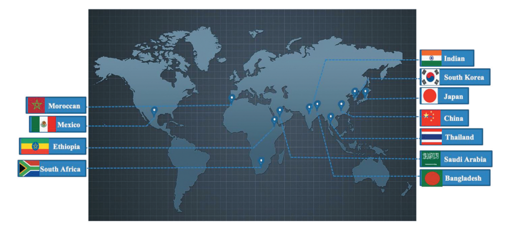
Figure 2. Countries were reported using herbal medicine for treating COVID-19 patients.