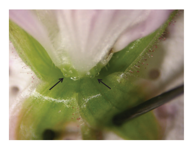
Figure 2. Position of the nectaries in a G. sylvaticum flower. Arrows show nectar droplets. doi:10.1371/journal.pone.0062575.g002

cut from the plant, placed with the peduncle into water in an Eppendorf tube to minimise the risk of desiccation, and brought to the lab within 30 min from the time of cutting. We noted flower gender (female, hermaphrodite) and the floral sexual phase. Nectar was extracted with paper wicks as described in [38] under a stereomicroscope to calculate total carbohydrate content. Nectar samples were then kept in an exiccator until total carbohydrate content was determined using the anthrone method [10], pp: 176–177). We prepared a series of sugar standards ranging from 0 to 50 \mu g of total sugar per mL of standard using equal amounts of fructose and glucose because even though nectar composition is unknown for G. sylvaticum , in other closely related Geranium species similar dominant proportions of fructose and glucose have been reported [5].