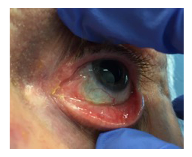
Figure 4. Surface of the eye at 6 months follow-up. Some scarring present medially (Image used with patient permission, courtesy of Division of Radiation Oncology, Peter MacCallum Cancer Centre).

improved cosmetic and functional outcomes. Radiotherapy can be in the form of plaque therapy, proton therapy, SXRT or electron beam irradiation.<sup>11–13</sup> The advantage of radiotherapy is that it provides a localised treatment of the targeted area that aims for tumour control with additional avoidance of adjacent healthy tissue. When treating ocular neoplasia, radiotherapy enables ocular function preservation and improved cosmesis compared to the surgical removal of