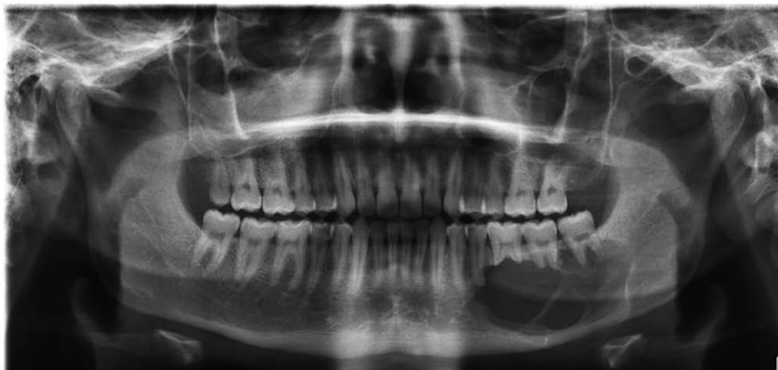
Figure 1. Panoramic radiograph showing multi-locular lesion in the mandibular posterior region.

with attachment of basal cell layer to the underlying basement membrane. Histopathologically, this artifact looks exactly similar to the pemphigus and Darier's disease. 13 In the present case, possibility of fix-