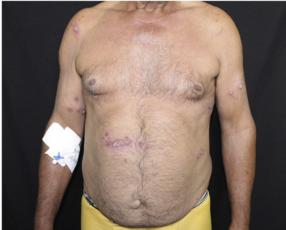
Fig 3. Novel skin lesions show disease activity. Erythematous papules and plaques on the upper limbs and the abdomen.