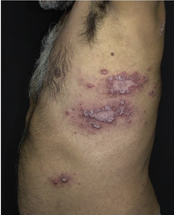
Fig 1. Multiple erythematous papules and ulcers with raised, erythematous borders located at the left lateral chest of a 56-year-old man.

patient with a daily ampoule—405 mg of pentavalent antimonial [Sb(V)]—for 10 days and then interrupted the medication for 7 days. After 3 cycles, we did not observe active lesions. In February, the patient returned with fewer remising patches (Fig 4). In April, he displayed noteworthy improvement, presenting hyperchromic patches on his chest and upper limbs. After 1 year, there was no sign of disease.