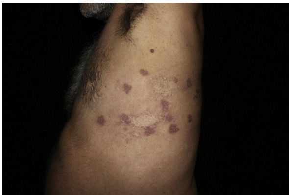
Fig 4. Hyperchromic patches with an atrophic hypochromic center on the chest. Fewer and remising skin lesions after 3 intercalated low-dose cycles of Glucantime.

Sb(III) accumulates until a plateau is reached. After 10 days without medication, however, the serum rates of antimonials are minor. 9 Hence, waiting 20 days to reintroduce the drug in case of disease activity is a questionable approach.