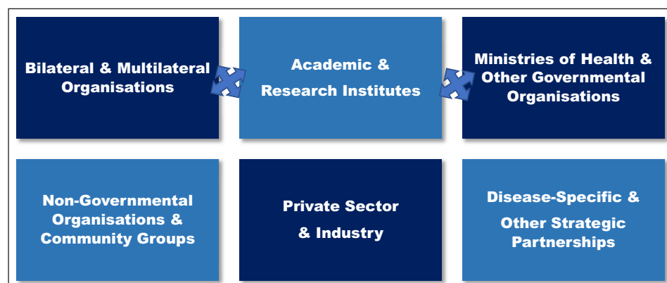
Figure 1 Types of partners that provide opportunities for partnerships.

Some potential partners for global health leadership training initiatives are highlighted in Figure 1 . The partnerships may take different forms (i.e., public-private; South-South/North-South; disease-specific), largely determined by goal, vision, infrastructure, funding, and key players in the partnerships.