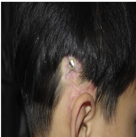
Fig. 3. Early ischemic necrosis of the flap caused by ill-planned incision.

Early postoperative implant extrusion occurred in 2 cases, with a small amount of secretion. One occurred soon after surgery (Fig. 3), perhaps because of an incision that was too long and extended to the auricle, disrupting blood supply from the post-auricular artery, which caused ischemia, flap infection and necrosis. The patient recovered after transposition skin flap repair. Another case was a one-year old child with anemia and malnutrition. Two months after operation, a small area of necrosis appeared in the flap over the implant. Perhaps, the thin scalp and high surface tension led to ischemic necrosis of the flap. Following active antibiotics, nutrition and other