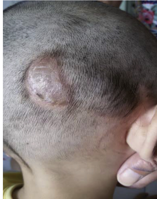
Fig. 1. Yellowish fluid was drained from the swelling and tested as serous in nature.

In our data, seroma around implants occurred in 1–2 years after cochlear implantation, characterized by eminentia around implants and obvious local fluctuation (Fig. 1). The drained fluid was yellow and serous in nature, with no pus or bacteria growth. These children had normal white blood cell counts and no fever, infection or other symptoms. It was highly possible that the seroma was associated with reaction to the silica gel that came with the implant. Seroma was clearly around silica gel in one child. The metal parts were not involved. The mechanisms leading to seroma formation remain unclear. Some believe that chronic inflammation may change the reaction to silicone rubber by the immune system and result in delayed allergy reactions (Kunda et al., 2006). Therein, after local pressure dressing, antibiotics, anti-allergic and symptomatic treatments, there was no seroma recurrence among the 15 children with minor symptoms. In the other 5 children with large seroma, the condition failed to improve despite repeated puncture drainages over a period of more than 2 weeks, complicated by flap infection and necrosis later.