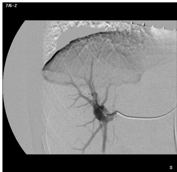
Figure 4. Follow-up arteriography demonstrated a complete occlusion of the damaged branch of the hepatic artery and no blood flow through the fistula.

supervision based on topographic lines and ultrasound data collected beforehand. This algorithm has been successfully used in our hospital for many years, but the complication in the described case shows that it is necessary to conduct liver biopsies in children under US supervision in order to avoid accidental puncture of the gallbladder or biliary ducts. There are other recommended methods that may reduce the frequency of hemobilia, such as laparoscopic biopsy, biopsy via the internal jugular vein or biopsy with embolization of the biliary tract [10–12]. In the described case, the lack of Sandblom’s triad made the diagnosis difficult. Ultrasound is a useful imaging technique whose quality depends on the physician’s experience. The US examination carried