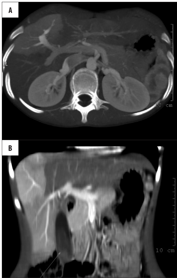
Figure 2. (A) In the late venous phase, the portal vein with intrahepatic flow is seen. Significant extravasation of the contrast agent from the middle portion of the right hepatic artery to one of the branches of the portal vein was found. During the examination the presence of contrast agent in the biliary ducts was observed which confirmed the existence of the arterio-biliary fistula with characteristic peripheral wedge-shaped hepatic parenchymal enhancement. (B) Coronal CT C + MPR reconstruction visualizes transient hepatic parenchymal enhancement (THPE). Triangular hyperattenuating area in hepatic arterial phase (segments VI and VII) with normal appearance of the rest of the liver in the portal phase. The presence of blood/haematoma in the gallbladder was confirmed (arrow).

artery. Contrast agent was also found in the biliary ducts, which confirmed the existence of the arterio-biliary fistula. The embolization of the right hepatic artery was performed using 0.2×0.2 cm fragments of spongostan. Following blood flow arrest, the Gianturco Wallach coil (diameter 0.4 cm, length 3 cm) was placed. A complete occlusion of the damaged branch of the hepatic artery and no blood flow through the fistula were seen in the follow-up arteriography. After the procedure, normal blood flow was observed. The boy was transferred to the Infectious Diseases Department for further specialist treatment after four days (Figures 3 and 4).