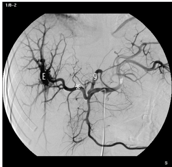
Figure 3. In the middle part of the right hepatic artery, significant extravasations (E) of the contrast agent (with the fistula to one of the branches of the portal vein) were visualised. Note the tortuosity of the common hepatic (*) and splenic (#) arteries. The left gastric artery (g) has a normal appearance.

There was no technical contraindication to liver biopsy in the described case. A puncture was made under sight