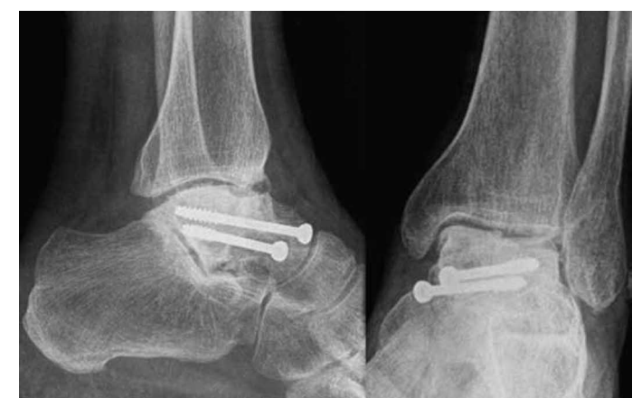
Figure 2 - Preoperative radiographs of the left ankle.

At the most recent follow-up consultation (12