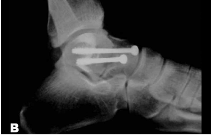
Figure 1 - A) Initial fracture of the talar neck, of Hawkins type II; B) Control in immediate postoperative period.