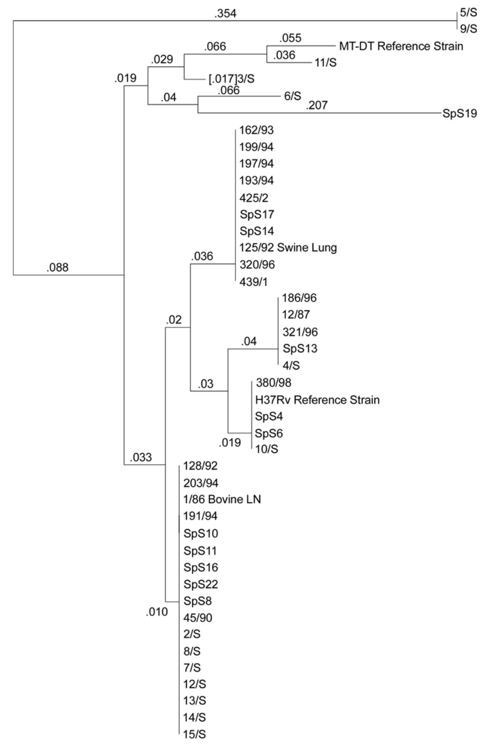
Fig. 2. Dendrogram showing genetic relatedness among Mycobacterium tuberculosis strains with primer OPN-02.

differences among M. tuberculosis strains. All primers amplified scorable fragments in each strain analyzed. The common or monomorphic bands among the different strains likely represent highly conserved regions in the genome.