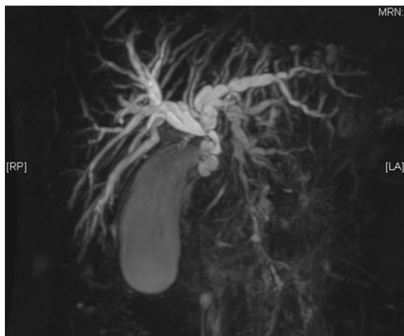
Figure 1 Magnetic resonance imaging showing the stenosis of the middle portion of the common bile duct and the dilatation of intra- and extra-hepatic biliary tree.

As the presumed diagnosis was that of primary bile duct tumor, in March 2013, the patient underwent a laparotomy (Figure 2). In addition to the mentioned abdominal imaging, the preoperative work-up included a chest X-ray that showed no lesion.