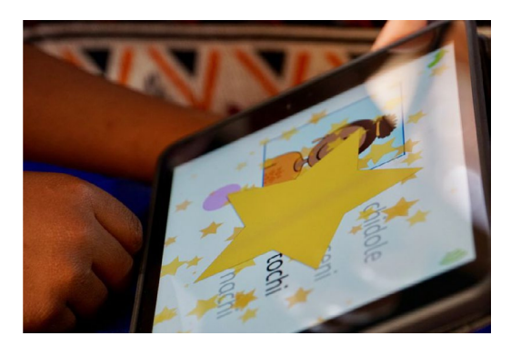
FIGURE 1 Illustration of how the onebillion app intervention is implemented in Malawian primary schools.