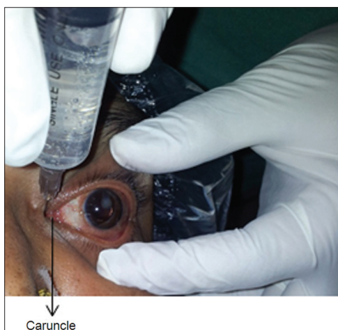
Figure 3: Needle entering between caruncle and medial canthal angle for performing medial peribulbar injection

Inadvertent intra-arterial injection of the anaesthetic