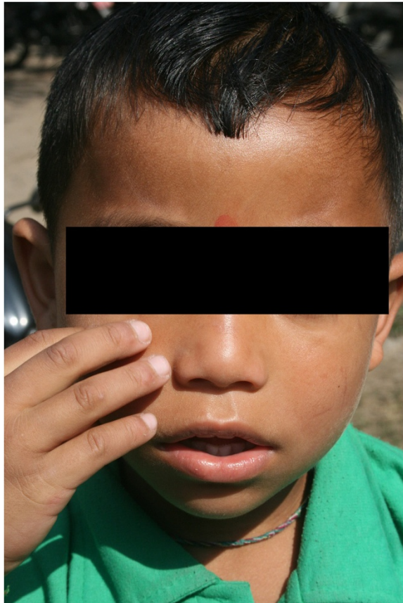
Figure 1 Picture showing the facial swelling and taut skin.