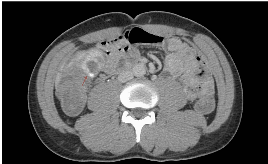
FIGURE 1: Computed tomography angiography acute gastrointestinal bleeding protocol revealing extravasation in the cecum and proximal ascending colon (red arrow).