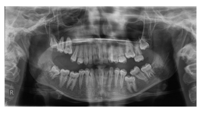
Figure 4. Patient's orthopantomography presenting Primary Failure of Eruption in all four dental quadrants.