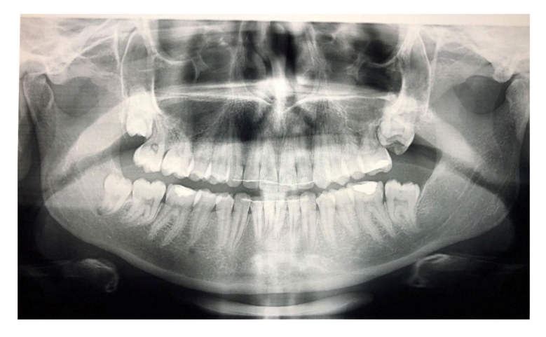
Figure 3. Patient after finishing the orthodontic treatment, presenting secondary retention due to fusion of the upper left second and third molars.

Clinically secondary retention is often assumed when a molar is in infraocclusion at a time period when the tooth should typically be in occlusion. The probability of ankylosis can be recognized via a percussion test and radiographic examination of the periodontal ligament obliteration. Nevertheless, such diagnostic means do not always prove reliable due to the fact that the ankylosed area in secondary retention is usually difficult to observe [12] (Figure 3).