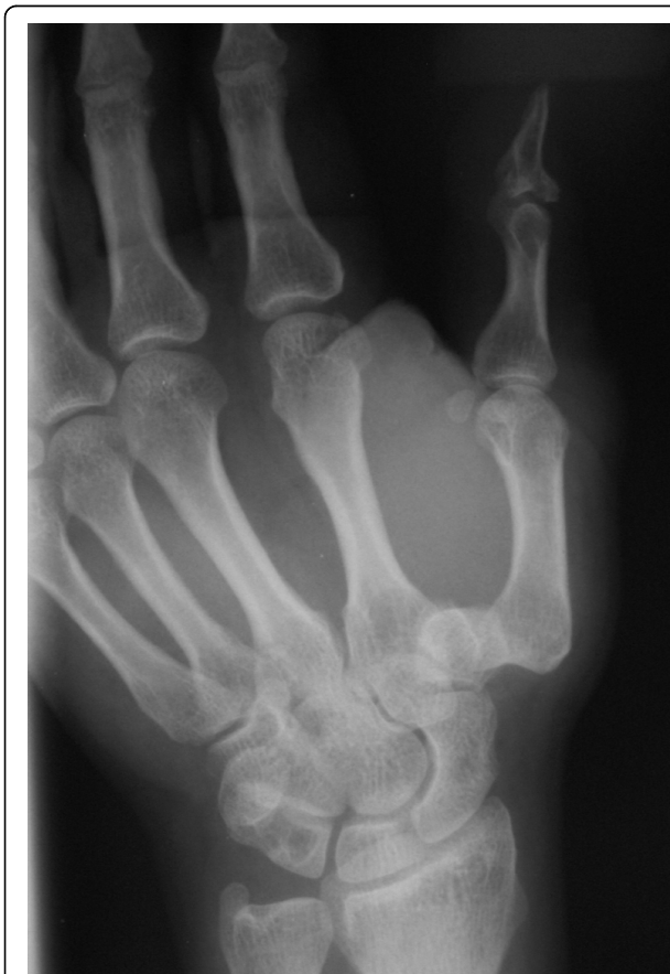
Figure 1 Anteroposterior radiograph of the right hand. Isolated thumb CMC joint dislocation is evident.

Intra-articular injection of local anaesthetic (xylocaine 2%) was followed by closed reduction of the carpometacarpal joint dislocation. However, the joint found to be grossly unstable and reconstruction of the dorsal capsulo-ligamentous complex occurred. The procedure was performed within few hours of the injury under regional anaesthesia using a dorsoradial approach. The dorsoradial ligament of CMC joint was found to be completely torn from its proximal insertion leaving a small cuff attached on the trapezium. The joint capsule was also transversely torn in its mid-substance but no articular cartilage lesions in both joint sides were evident. (Figure 2). The volar ligament was remained also intact. After debridement of the dorsal surface of the trapezium the dorsoradial ligament was stabilized onto trapezium using a Mini-Mitec suture anchor loaded with a 2-0 suture material (Ethibond). Furthermore, the CMC joint capsule was repaired in an