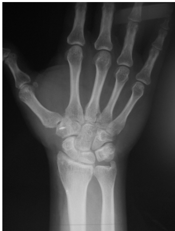
Figure 4 Anteroposterior radiograph of the right hand 3 years post-operatively. Good joint congruency without signs of instability or osteoarthritis are seen.

Simonian and Trumble [12] compared early ligamentous reconstruction with closed reduction and pinning. Four out of 8 patients who initially treated with closed reduction and percutaneous pinning showed recurrent instability. In reconstructive group (minimum follow-up period of 2 years), painless full range of motion and normal grip strength were observed. A good result was seen also from Chen VT [2] in a patient who treated with dorsal ligament reconstruction. Shah and Patel [7] advocated that open reduction and K-wire fixation without ligament reconstruction might not be adequate for this type of injury. In their series 2 patients had dorsal