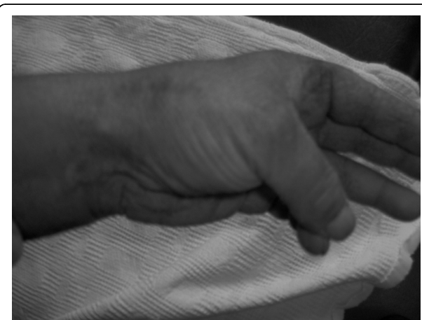
Figure 3 Appearance of the right hand 3 years post-operatively. The patient had normal and painless thumb movement.

At 3-year follow-up, the patient was pain free and returned to the pre-injury level of activity. No limitation of thumb carpometacarpal joint mobility or residual instability was observed (Figure 3). Radiographic examination revealed normal joint anatomy without any signs of subluxation or early osteoarthritis (Figure 4).