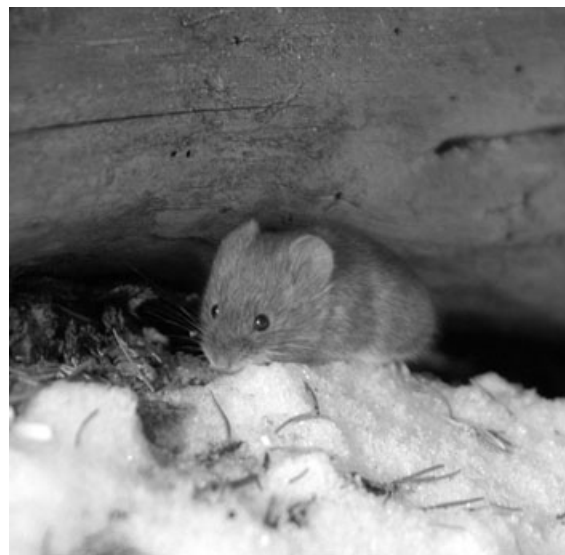
Figure 1. Study species, the bank vole Myodes glareolus is a small rodent species common in northern Europe. The main habitats are forests and fields, and the diet typically consists of forbs, shoots, seed, berries, and fungi.

We aimed to study the effects of past and present densities on the body mass, condition, and survival of young bank voles ( Myodes glareolus Schreber) (Fig. 1), by designing an experiment where individuals born in an enclosure population of 8, 12, 16, 20, or 24 adult individuals were transplanted in either a low (9–10 adult individuals) or a high (18 adult individuals) density enclosure to overwinter. We hypothesized that a change in population density would lead to a mismatch between an immediate adaptive response and future environment, and thereby to lowered individual fitness (Bateson et al. 2004). This idea parallels the concept of predictive adaptive responses (PAR) of human evolution, which states that organisms preset their physiology according to the cues of their prenatal environment in expectation that particular physiology will match their future environment (Gluckman et al. 2005). In our study, however, we cannot quan-