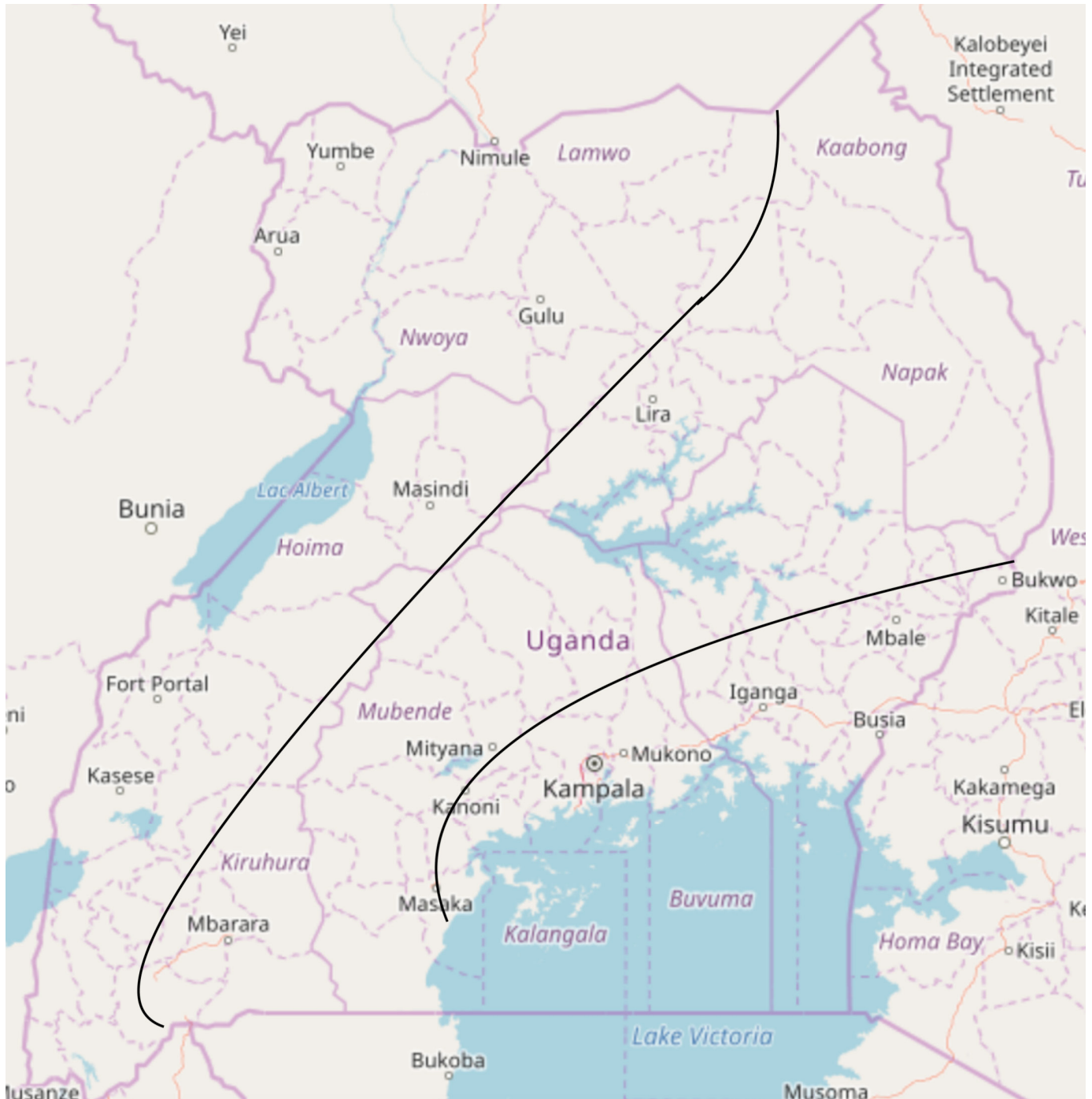
Figure 1 Map of Uganda with the cattle corridor indicated as the region between the black borders. Also noted is the location of our study site, Mbarara, in the southwest. Original map obtained from Open Street Maps (© OpenStreetMap contributors, www.openstreetmap.org/copyright ) and edited for demonstration and clarity purposes.

and their food products. 16 Additionally, Mbarara is home to Mbarara Regional Referral Hospital (MRRH) and Mbarara University of Science and Technology (MUST), both of which are collaborators on this project. MRRH serves as a healthcare hub for the region, treating both local patients and those sent from across the bulk of the southwest region from smaller medical centres. Due to this status as a referral centre, as well as the close relationship with MUST, there are more resources and equipment available at this site that we can use for our study.