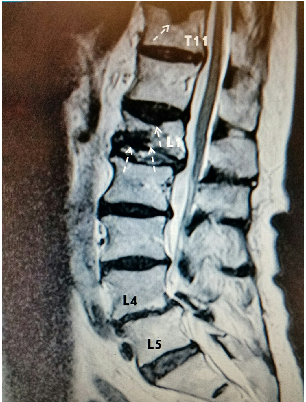
FIGURE 2: Lumbar spine MRI sagittal view of a patient with lower back pain. A T11 schmorl node with a chronic superior endplate fracture (single dashed arrow), acute L1 superior and inferior endplate fractures with vacuum phenomenon (three dashed arrows), and L4-L5 grade I anterolisthesis with multilevel spinal stenosis are appreciated