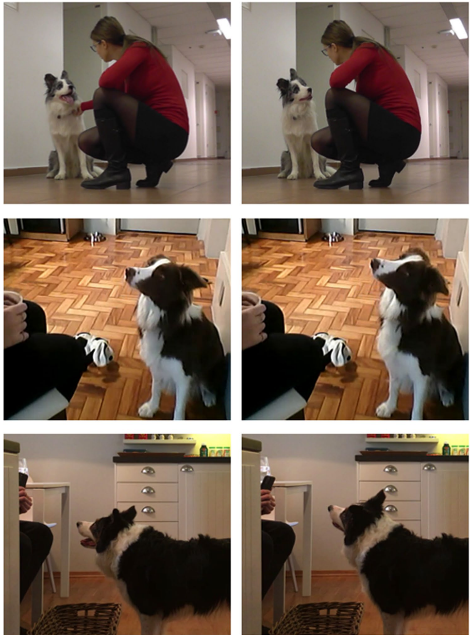
Fig. 1 From top to bottom: Max, Gaia, and Whisky just before and while performing a head-tilt (left and right photos, respectively) during Experiments 1 and 2