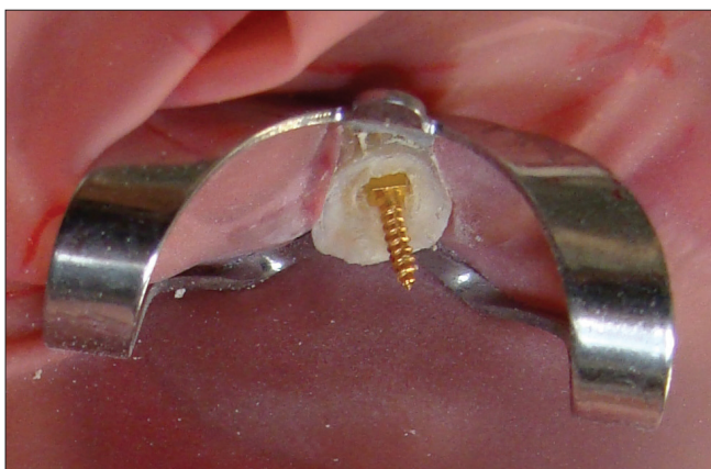
Figure 5: Reverse metal post is trying in the entrance of the filled canal