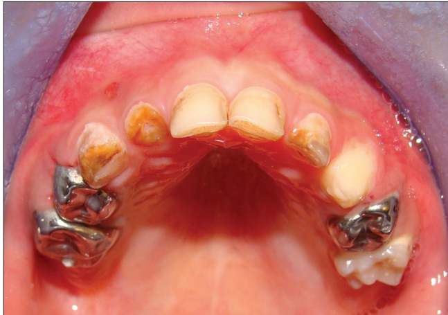
Figure 1: Initial view of the maxillary teeth

According to the previous studies, the use of prefabricated nonmetallic posts such as ceramic posts,