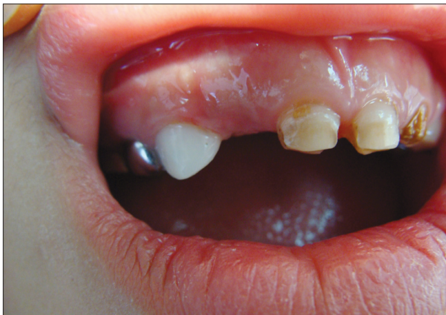
Figure 11: Frontal view of the restoration after 18 months