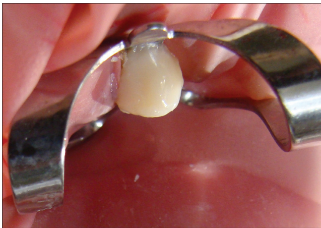
Figure 9: Reconstructed crown with composite resin