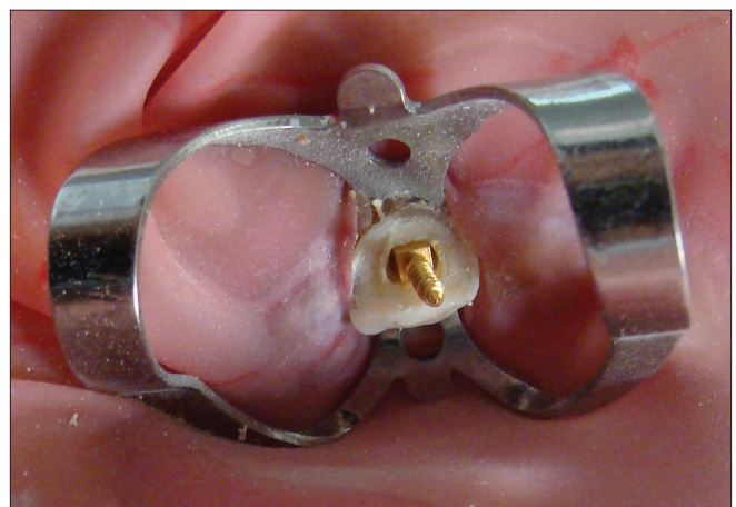
Figure 6: Reverse metal post occlusal view