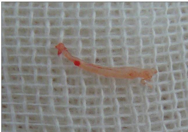
Figure 3: Extirpated pulp