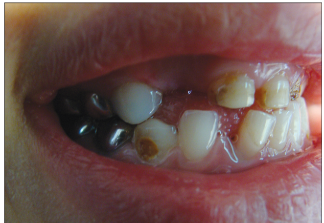
Figure 12: Lateral view of the restoration after 18 months

carbon fibers, polyethylene fibers, ribbons or tapes, glass fibers, etc. [2,3,5,9,10,17] in the reconstruction of extremely damaged primary anterior teeth has been an acceptable treatment option. Good adaptation to the canal walls by the application of composite resin, enough retention