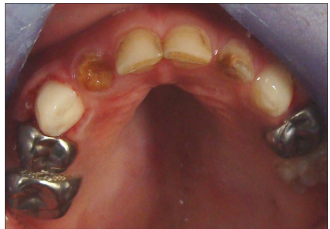
Figure 10: Final restoration