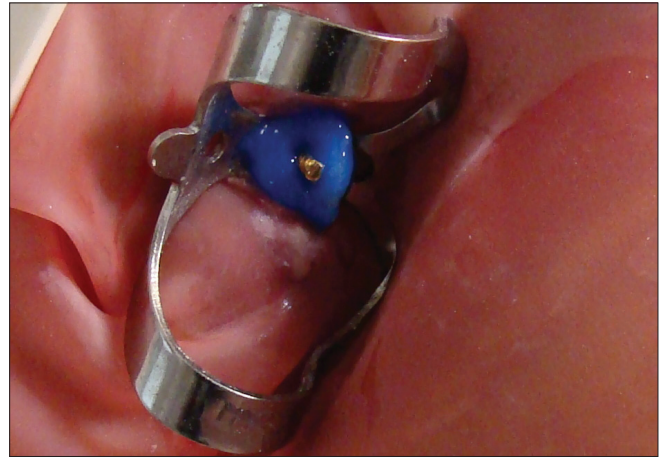
Figure 8: Acid-etching