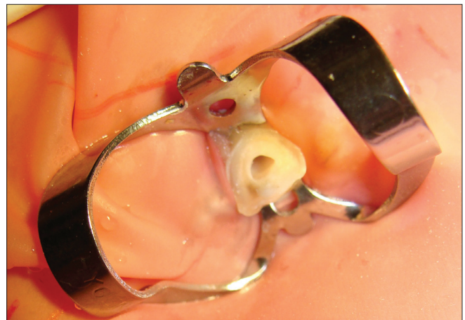
Figure 4: Prepared canal