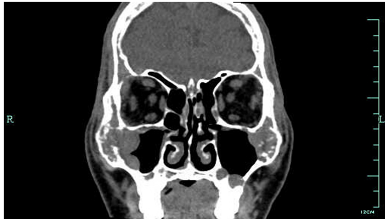
Figure 2 Computed tomography of the sinus spiral. Computed tomography of the sinus spiral showing a pansinusitis and diffuse bone destruction of craniofacial bone.

similar cases have been reported with bilateral immature plasma cells pleural involvement [4,5].