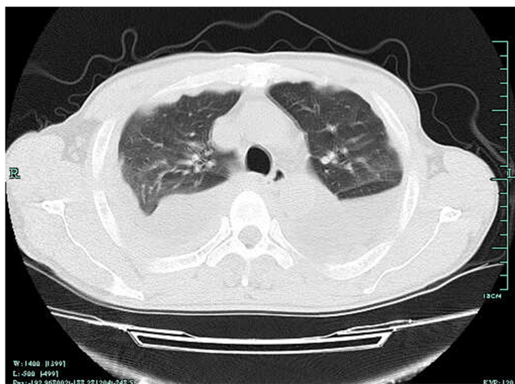
Figure 1 CT scan of the thorax. CT scan of the thorax showing a bilateral pleural effusion, diffused pleural thickening and multiple nodular lesions in the parietal pleura.

Sasser et al. showed 56 cases of MM with the involvement of the serous cavities. The sites of involvement included the pleural cavity in 30 cases, among which, over 50% of the cases with cavitory involvement were of the IgA type [3]. Involvement of the bilateral pleural effusion by multiple myeloma is extremely rare. So far, only two