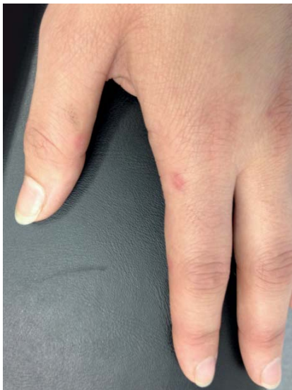
FIGURE 2: Erythematous papules on left hand