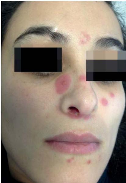
FIGURE 1: Erythematous papules with central suppuration on the face

KD is a benign disease, whose etiology and pathogenesis remains unknown, although the hypothesis that immune-mediated mechanisms might activate KD has been postulated. 3,4,7 Some viral infections, such as human herpes virus-6, Epstein-Barr virus, cytomegalovirus, parvovirus B19 and human immunodeficiency virus have also been proposed as possible triggering factors for KD. 1,3,7