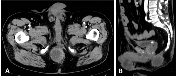
Figure 1: Preoperative CT that documents the absence of a clear cleavage plane between the neoplasm and the urethra in axial (A) and sagittal (B) scans.

he noticed the appearance of right ischial-rectal abscess associated with a perianal fistula with evidence of rectal adenomatous villous lesion with high-grade dysplasia. So, the patient went to surgery with proctectomy in November 2018 for adenocarcinoma G2 infiltrating the muscle tunic (pT2 pN0 M0 sec. ajcc 2017). The surgical resection margins were free from neoplastic localization.