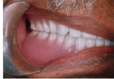
FIGURE 5: Posterior teeth at occlusion.