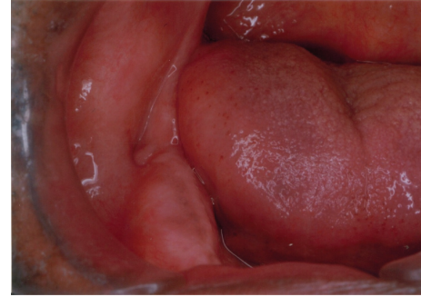
FIGURE 2: Postsurgical depression due to dentigerous cyst enucleation at third molar region.

The patient was advised to consume the PD medicine (Levodopa) one hour prior to treatment. The appointments were fixed in the morning time for the short duration of 45 minutes. The patient was requested to empty his urinary bladder before treatment initiation to avoid urinary urgency and incontinence. A special emphasis was made to treat the patient in compassionate, caring environment to alleviate anxiety and frustration behaviour. The patient's wife was made to sit next to the patient to reduce the anxiety and to help in interpreting the patient's speech. The sympathetic approach was followed to allow slow response rate of patient during communication.