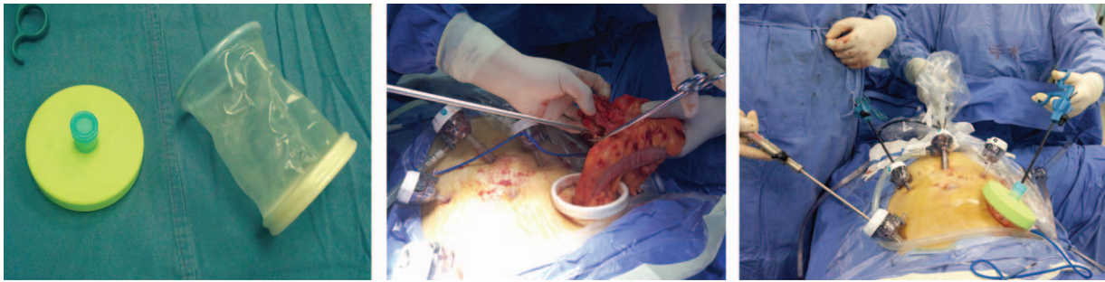
Figure 1. The wound protector group had a plastic wound protector that was placed through a 5 to 7-cm skin incision following mobilization of the colon and rectum or laparoscopic intestinal anastomosis.

Shanghai Renji Hospital from January 2015 to June 2016. Consecutive CRC patients who were treated with laparoscopic surgery were enrolled. Patients with diabetes, anemia, insufficient bowel preparation, and severe cardiac and pulmonary dysfunction were excluded from this study. Patients older than 75 years were also excluded. Patients undergoing a complete laparoscopic colon resection and rectum resection were excluded. The protocol was approved by the medical ethics committee of our hospital, and written informed consents for diagnosis and treatment were obtained from all patients prior to the procedures.