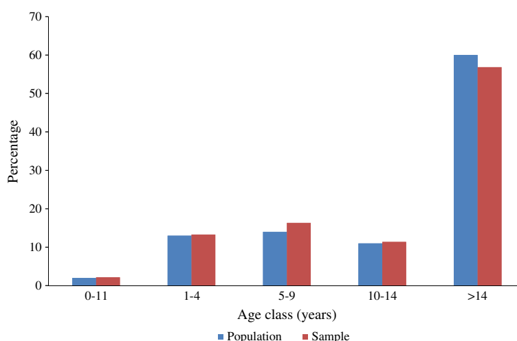
Figure 1 Age-specific distribution of the total and the sampled population.

Logistic regression analysis was carried out by considering SPR (0-negative, 1-positive) as dependent variable and the other study variables, such as age, gender and ecotype, as independent variables. The overall fit of the logistic model was found to be good fit (Hosmer and Lemeshow Test: \chi^2 = 12.68 ; df = 8 ; P = 0.123 ). Individual co-efficient of independent variables was also found to be statistically significant ( P < 0.05 ). The estimated odds ratio (OR) with 95% confidence interval for females was 0.84 (0.76-0.93) indicating that the risk of getting malaria among females is significantly ( P < 0.001 ) less than that of males (OR = 1.0). Similarly the OR for foothill (0.58; 95% CI = 0.5-0.67) and plain areas (0.35; 95% CI = 0.29-0.41) were significantly ( P < 0.001 ) less than that of hilltop villages (OR = 1).