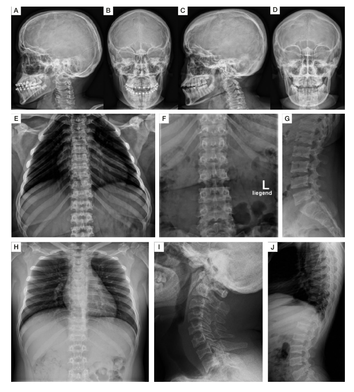
Figure 1 Phenotype of skull, thorax and spine. Lateral skull radiographs show mildly thickened calvarias of S1 (A, B) and S2 (C–D). S1 and S2 show an open bite (A, C). Radiographs of chest and spine show broad (oar-shaped) ribs (S1 at 17 years (E, F) and S2 at 14 years (H)), broad vertebral bodies, platyspondyly and irregular endplates (S1 at 17 years (G), S3 at 18 years (J)). S1 shows a bell-shaped thorax (E). Radiographs of lateral spine additionally illustrate anterior beaking and irregular vertebral end plates (J). Lateral spine radiograph of the lumbar area shows platyspondyly with scalloping of the posterior end plates (S1 at 12 years (G)). Anterior inferior beaking of the cervical spine of S3 at 20 years (I). S1–S4, subjects 1–4.

Heart abnormalities in S1 and S2 included cardiac murmur (aortic or mitral), valve disease, thickened leaflets and