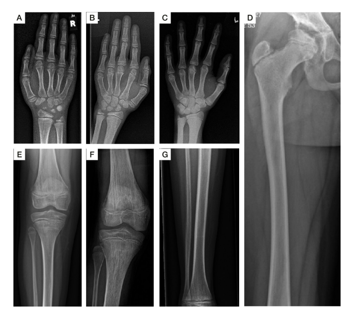
Figure 2 Radiological abnormalities of the extremities. Hand radiographs demonstrate short third, fourth and fifth metacarpals, small carpal bones and small epiphyses of lower ends of radius and ulna (S2 at 14 years (A), S4 at 17 years (B), S3 at 18 years (C)). Posterior-Anterior (PA) projection hand radiograph of S2 at 14 years shows defective ossification of the carpal bones associated with retarded bone age. Apparent metaphysial irregularities and dysplasia along the metacarpophalangeal joints (A). PA right pelvis radiograph of S2 at 14 years (D) shows dysplasia and fragmentation of the capital femoral epiphysis associated with acetabular dysplasia. The shaft of the femur is overtubulated. Radiographs of the femora and tibiae demonstrate vertical striae in the metaphyses (S2 at 14 years (E), S4 at 17 years (F)). Tibia and fibula of S2 at 14 years show overtubulation of the shafts (G). Epi-metaphysial dysplasia of the inferior ends of the tibia and fibula. Metaphysial irregularities are associated with metaphysial striation (G). S1–S4, subjects 1–4.

S4 was below the third percentile, proportionate to height at the ages of 18 years and 17 years, respectively.