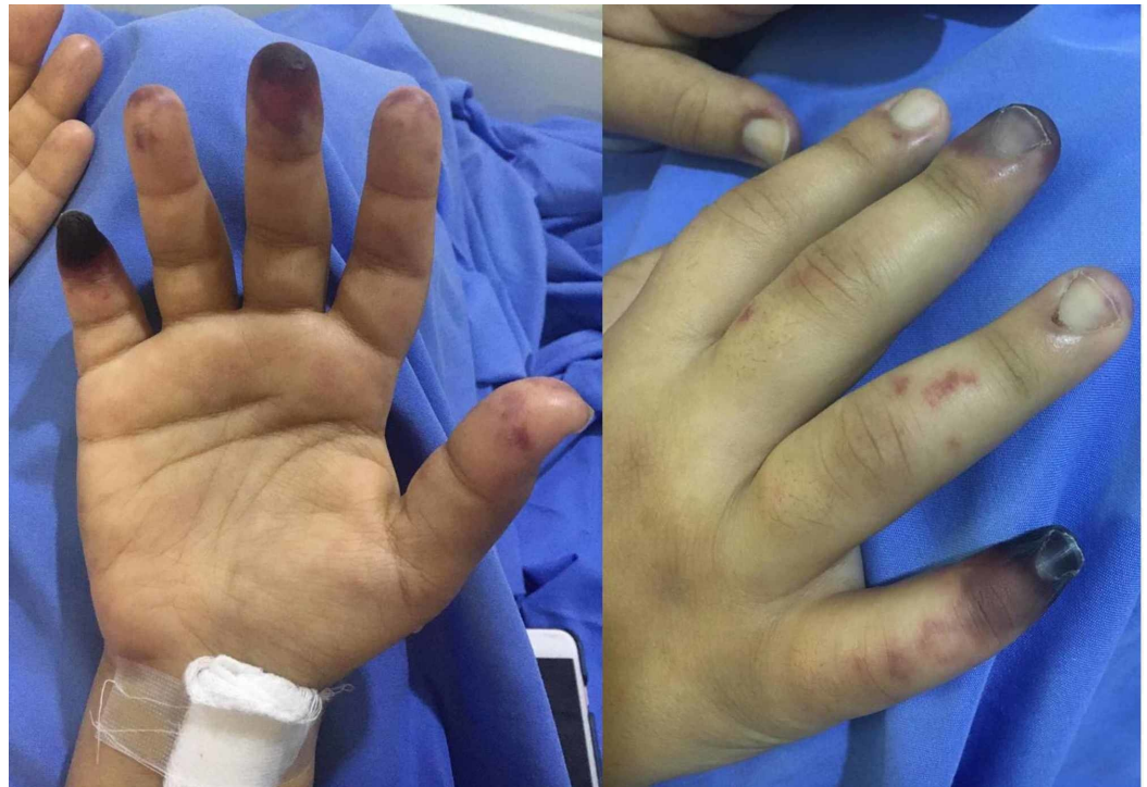
FIGURE 1: Dry gangrene located on the tips of the third and fifth digits of the right hand of a 20-year-old female.

On examination, the vital signs included a heart rate of 125 beats/min, a blood pressure of 129/64 mm/Hg, a respiratory rate of 20 breaths/min, and a temperature of 38°C. For her general appearance, the patient appeared mildly pale. She had palmar erythema in the right hand as well as localized dry gangrene in the tips of the third and fifth digits (Figure 1). There were purpura and livedo reticularis on the feet extending to the distal legs with hotness and tenderness (Figure 2). There was no edema or signs of deep venous thrombosis. Cardiovascular, chest, and abdomen examinations were all insignificant.