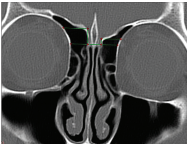
Figure 4: Coronal CT scan showing asymmetry in the depth of OF on either sides. Difference of >2 mm is seen in the OF depth between two sides. Both sides have different Keros type OF (type III on right and type I on left side)

Statistical analyses were done using IBM SPSS Statistics Ver 20.0. [12] The results were grouped according to Keros classification and their distributions were analyzed according to gender and laterality. The statistical significance was set to P < 0.05 .