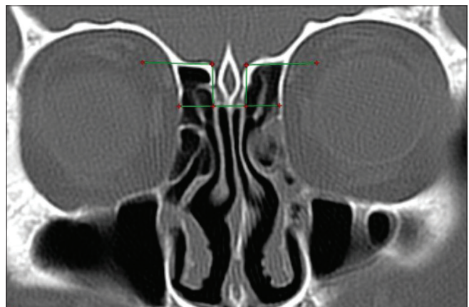
Figure 3: Coronal CT demonstrating type III Keros classification. Here the olfactory fossae are very deep compared with types I and II

All the CT images were acquired in a helical Hi-Speed tomograph (GE HiSpeed NX/i Pro Dual Slice). Images were acquired perpendicularly to the hard palate, from the anterior margin of the frontal sinus to the anterior margin of the clivus, with the patient in prone position. The technical parameters adopted in the acquisition of tomographic