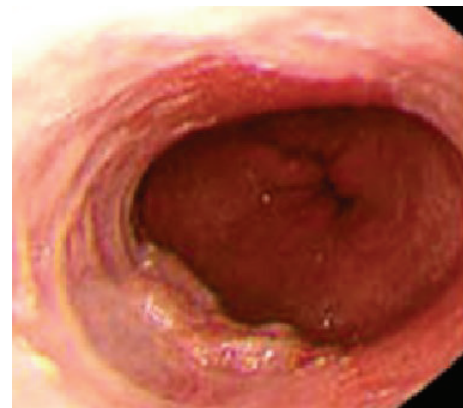
FIGURE 1: Superficial type 0-Is lesion.

The differences in histopathologic diagnoses among all patients according to the type of the specimen (biopsy versus EMR) were shown in Table 3. According to kappa statistic of interrater agreement, the agreement and disagreement between biopsy based and EMR based histopathologic diagnoses were described in Figure 2 and Table 3. Agreement between biopsies and EMR was found only in 28 cases