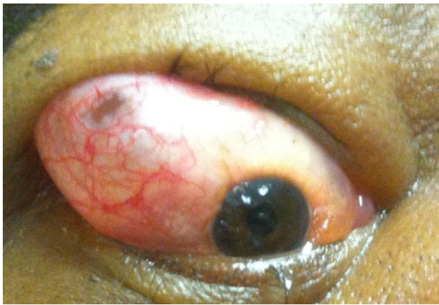
Figure 1 The upper eyelid is trapped behind an engorged and very large superotemporal filtering bleb.

Note: The lower eyelid is in normal position.