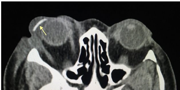
Figure 2 Computed tomography image of the orbit demonstrates the superiorly subluxed globe with a superotemporal Ahmed valve (arrow).

Note: The lower eyelid is in normal position.