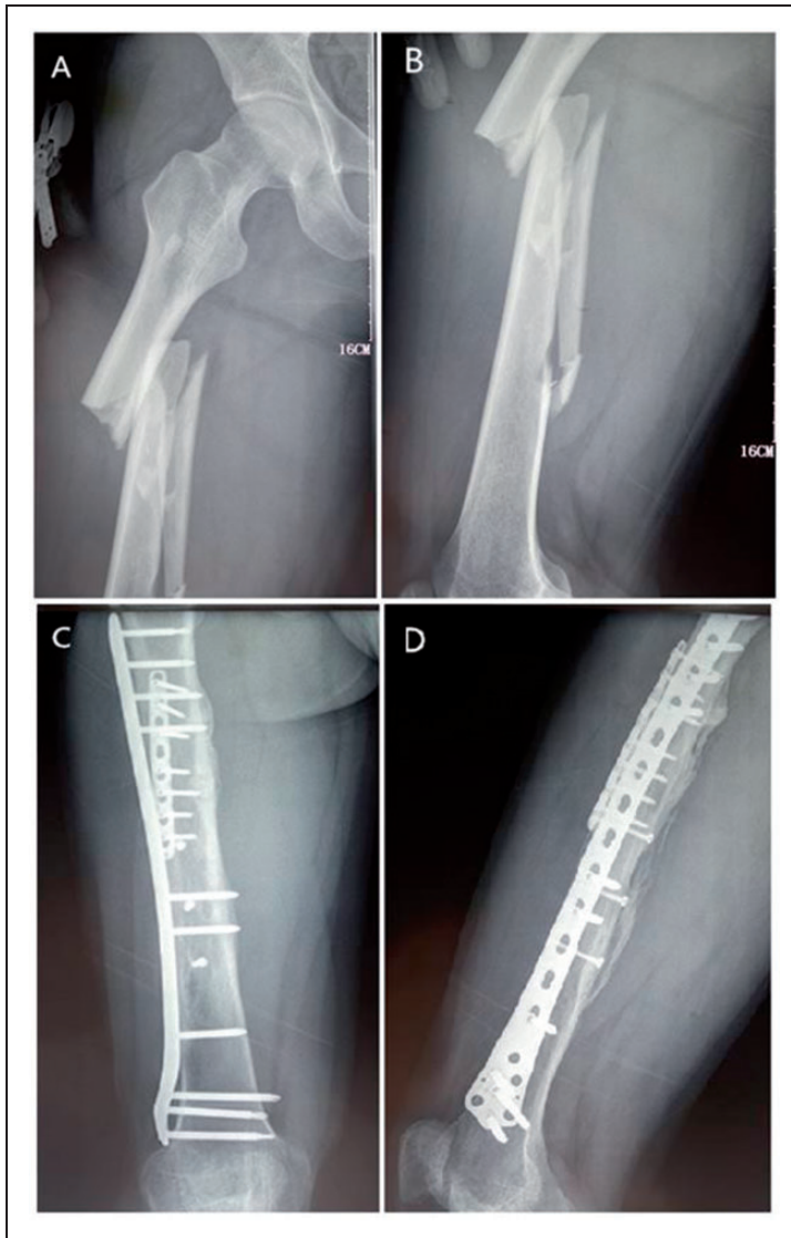
Figure 2. (A, B) Preoperative radiographs of the injured femur. (C, D) Radiograph 9 months after the operation shows union of the femur.

classification system of diaphyseal femoral fractures, an increase in the Winquist grade may reveal a high degree of comminution and instability as well as less cortical bone contact. 11 The use of an indirect/closed reduction technique for a comminuted fracture may result in inaccurate reduction and malunion. 11,12 In severely comminuted