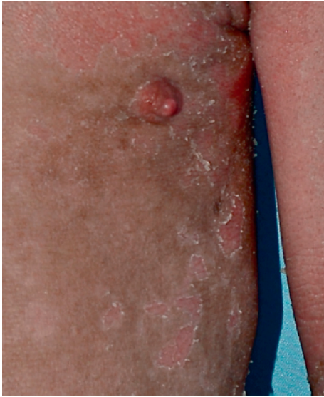
FIGURE 1: Serpiginous, erythematous plaques with double-edged peripheral scale.