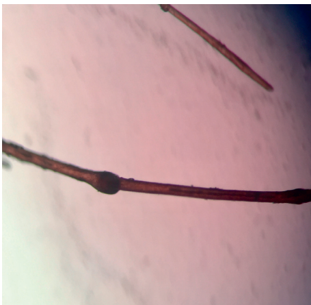
FIGURE 2: Trichoscopic examination of the child's scalp hair showing trichorrhexis invaginata (bamboo hair).