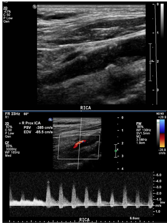
Fig 1. A carotid duplex scan indicated critical right internal carotid artery (ICA) stenosis but no indication of abscess or carotid infection.

that he had suddenly died at home 4 months after surgery. The patient had reportedly recovered to his baseline status and suddenly collapsed. He was pronounced dead at the scene, and autopsy was declined.