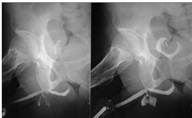
Figure 1: Retrograde urethrogram showing the urethral fistula arising from penoscrotal part and extension spreading from contrast medium into the scrotum

were given accordingly. The patient had no other complaint following the surgery and as for the patient's neurological condition we continue for rehabilitation program. After 7 days, there was reduction of the scrotal mass and no systemic infection was detected. The patient was discharged with suprapubic catheter and referred back to the original hospital for further treatment and observation.