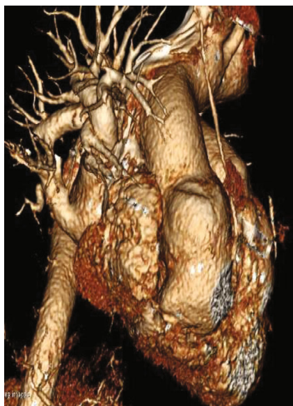
FIGURE 2: Computed tomography angiography of the sinus of Valsalva aneurysm, sagittal view. The right and noncoronary cusps are fused, separated by a raphe.

of 0.35% [2]. This variant carries a low risk of sudden cardiac death albeit the risk of coronary artery disease remains debatable [2].