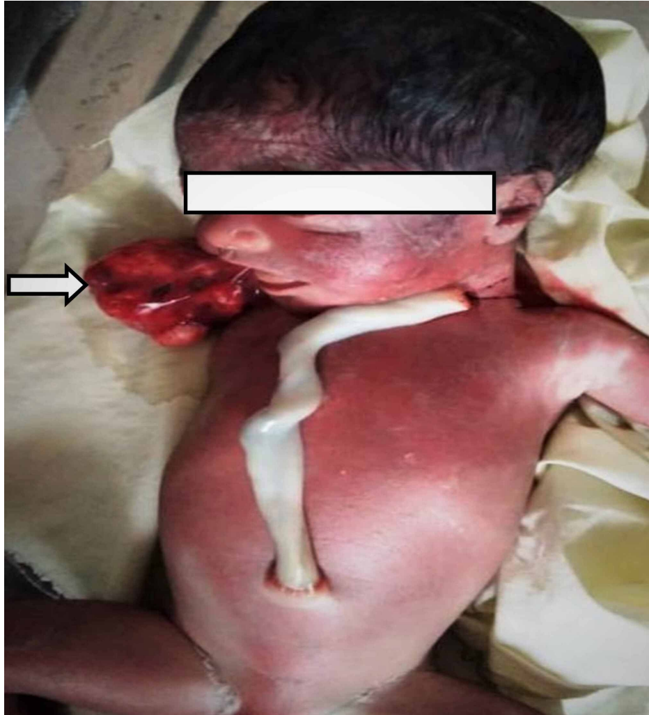
FIGURE 3: Fetus showing mass protruding from the oral cavity.