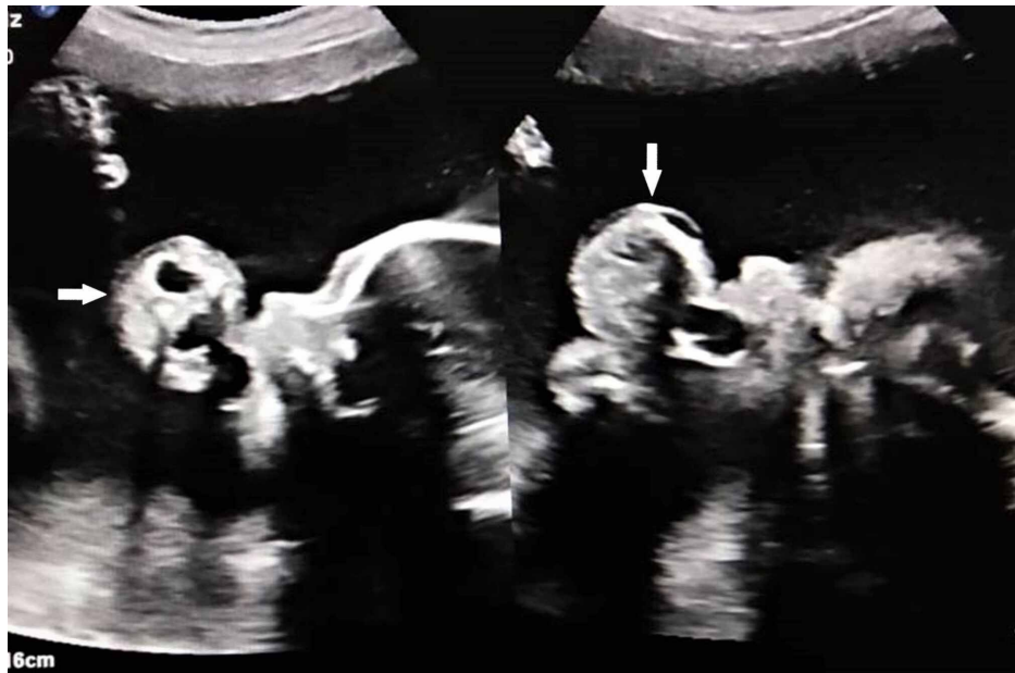
FIGURE 1: Ultrasound showing a pedunculated polypoidal mass protruding from the mouth of the fetus and freely floating in the amniotic cavity. The mass has mixed solid-cystic echotexture with areas of calcifications and minimal vascularity.