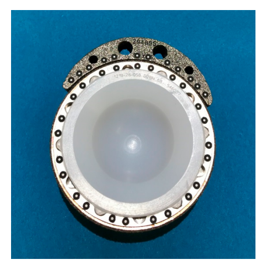
Figure 1. Photograph of acetabular cup, augment and liner. Note the attached optical marker points along the rim of the cup and augment.

Marker points (size 0.8 mm, GOM Gmbh, Braunschweig, Germany) trackable by an optical measuring system were placed around the circumference of the cup rim. They were also placed along the rim of the augment that constituted 30% of the entire cup circumference (see Figure 1).