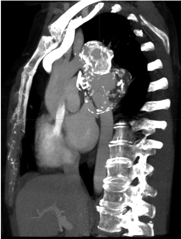
Fig 1. Computed tomography angiogram depicts the aneurysm preoperatively.