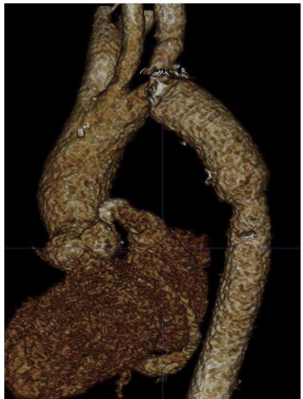
Fig 3. Predischarge three-dimensional computed tomography image shows complete repair of the aneurysm with no extravascular leakage.

We present a simple solution to address, at the same time, either the spinal perfusion or the increase of pressure above the aortic clamp during a complex aortic aneurysm repair. It is a simple modification of a passive