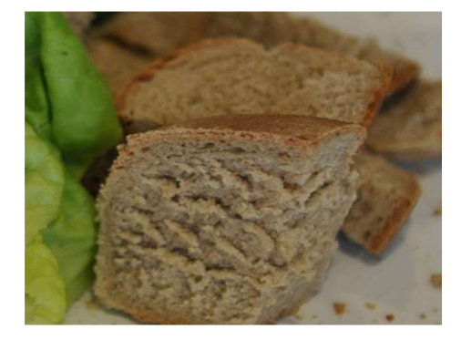
Figure 3. Piece of bread with insect powder addition.