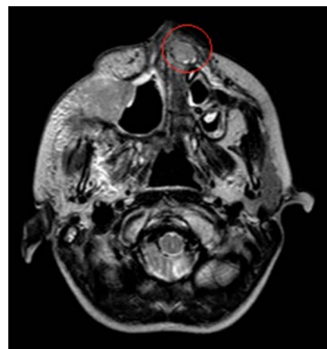
Figure 2. Magnetic resonance imaging demonstrating known right-sided disease and progression during treatment (red circle).