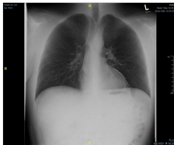
Figure 2: Chest X-ray with atypical pneumonia-like features

Imaging: Echocardiography remained unremarkable. Dual X-ray energy of the chest was suggestive of atypical pneumonia treated with oral clindamycin (Figure 2).