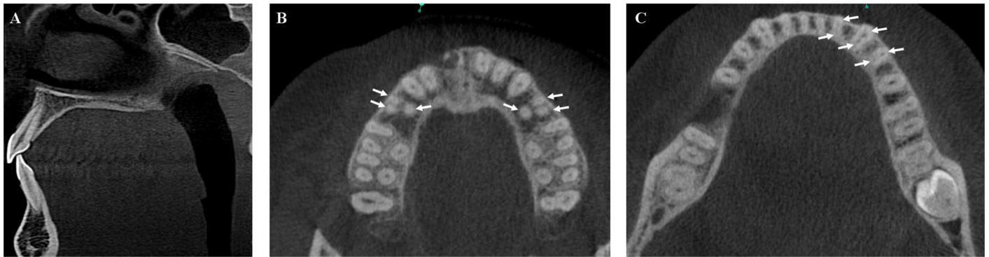
Fig 1. CBCT acquisitions to illustrate the presence of additional canals. (A) Sagittal CBCT image of a mandibular central incisor with one root and two canals. (B) Presence of an additional canal bilaterally in first maxillary premolars (white arrows). (C) Additional canal (white arrows) concomitantly on mandibular incisors, canines and first mandibular premolars, together with no variability on mandibular molars (3 canals, 2 roots).